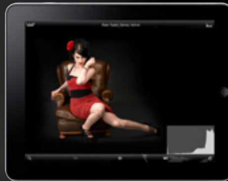
Capture Pilot and Camera Control